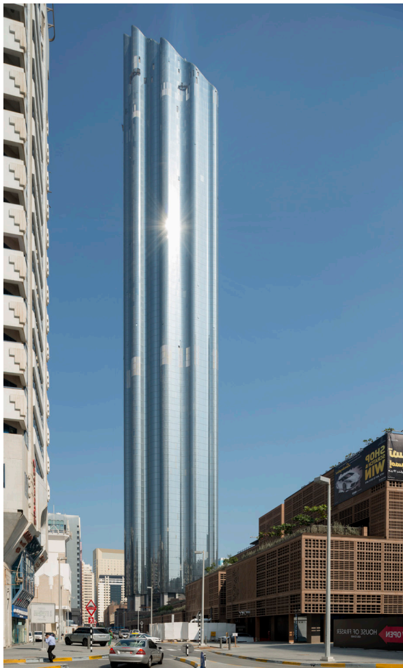
Featured WSP project: Burj Mohammed Bin Rashid Tower.

Together, Revit and Ideate BIMLink help WSP attract the best people and enable them solve problems that shape the communities of tomorrow.