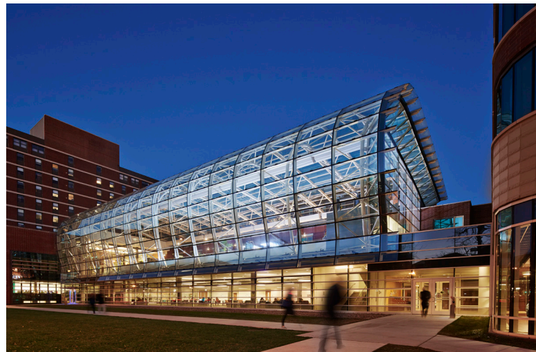
Featured WSP project: Institute of Environmental Sustainability, Loyola University.

T ogether, Revit and Ideate BIMLink help WSP attract the best people and enable them solve problems that shape the communities of tomorrow.