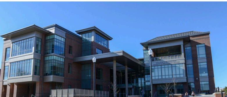
Pennington Student Achievement Center at the University of Nevada, Reno. 70,000 square foot building designed by Ainsworth Associates Mechanical Engineers, H+K Architects, and CORE Construction.